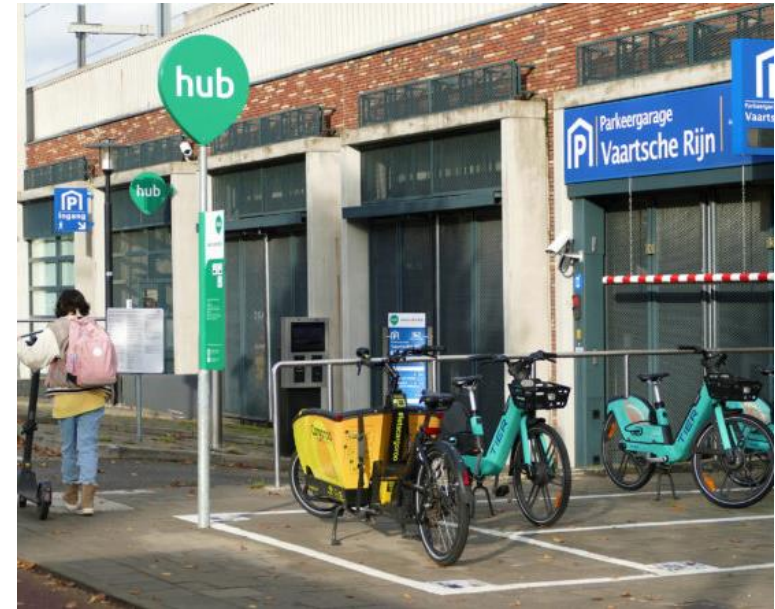
Mobility Hub Vaartsche Rijn (Utrecht) with the Dutch national hub identity