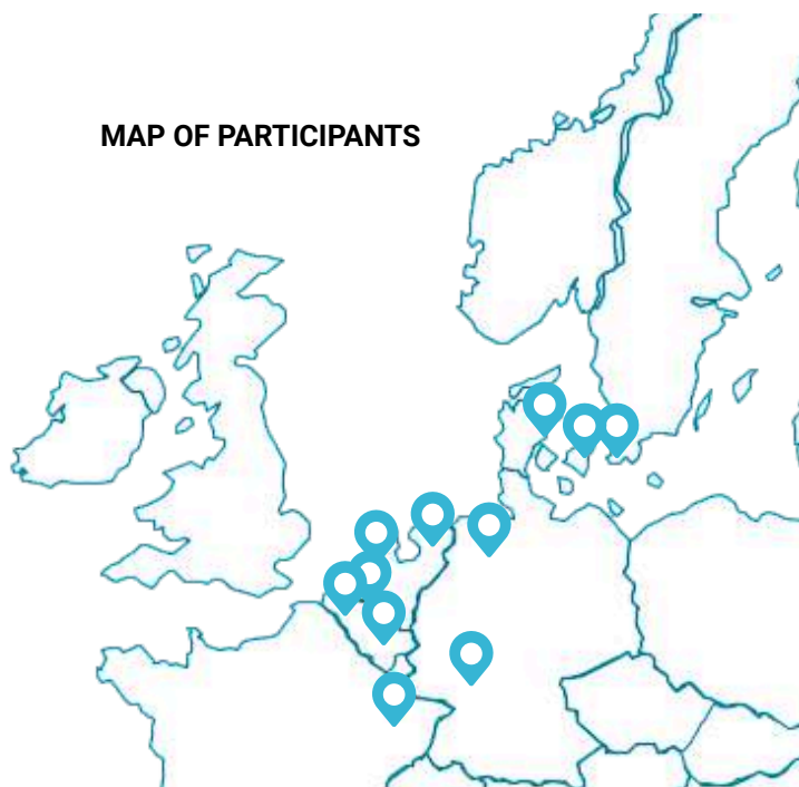
MAP OF PARTICIPANTS

These new sets of actions, which make up a 'local energy action planning' approach, focus on using the municipality's unique position within the local economy and governance structures to design an energy system that meets their objectives - typically one that delivers a competitive, affordable, resilient and decarbonised local energy economy.