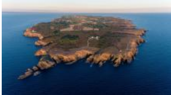
Figure 2, Île de 'Groix

In recent years, discussions around sustainable tourism and environmental conservation have become