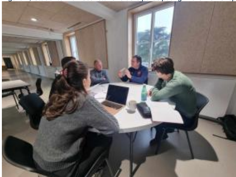
Figure 1, Students with local stakeholders participating in the workshop

In the first phase of this project, we identified innovation gaps on the island of Koster Sweden, through semi-structured interviews with stakeholders from the public, private, and civil sectors. This paper presents the next phase of the project, which uses design thinking and the double diamond framework to co-create solutions to the identified challenges through a workshop.