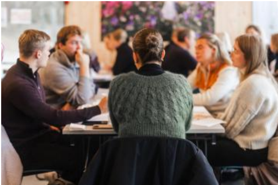
(Students and Stakeholders during the Workshop)