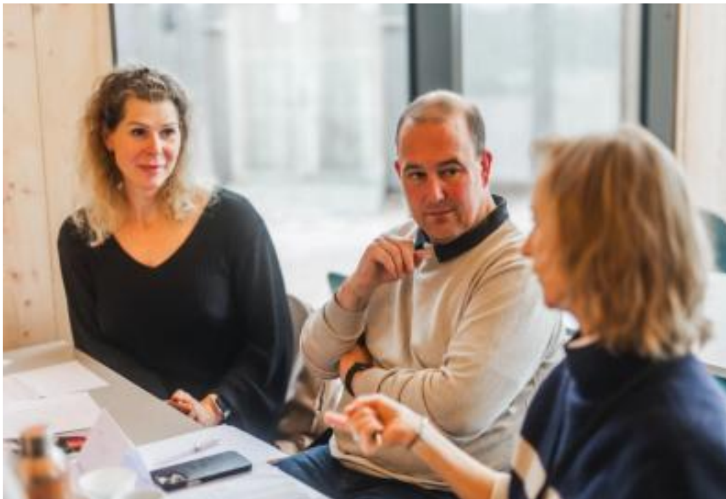
(Students and Stakeholders during the Workshop)