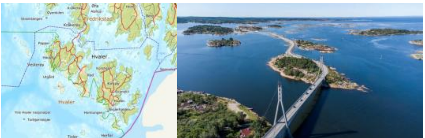
(Skjelsbusund Bridge that connects Hvaler to the mainland, making it possible to drive to the islands by car.)

The municipality is led by Mayor Mona Vauger from the Labor Party, whose priorities include balancing sustainable development with the preservation of Hvaler's unique environmental and cultural heritage. Hvaler's commitment to protecting its natural resources while navigating modern challenges reflects the community's determination to secure its future for both residents and visitors. ( Hvaler – Island by Island, u.å. )