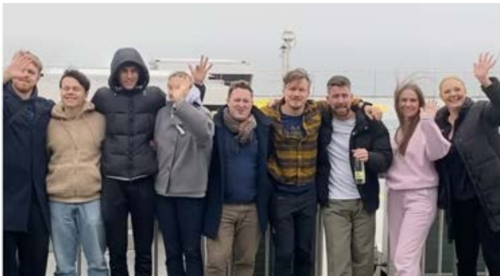
(Students on the ferry from Ystad to Rønne.)

The following sections focus on the interviews conducted on Bornholm island, Denmark, as part of the initial phase of the FREIIA project. It highlights the recruitment process for stakeholders and the methodology employed to ensure diverse representation from public, private, and civil sectors. The student-led interviews revealed key challenges, including limited cross-sector collaboration, an aging population, and insufficient platforms for innovation. These findings, gathered through the application of the UNIC method(gap analysis), provide a foundation for the next phase, where Design Thinking based Co-creation workshops will focus on developing tailored solutions to address the identified gaps.