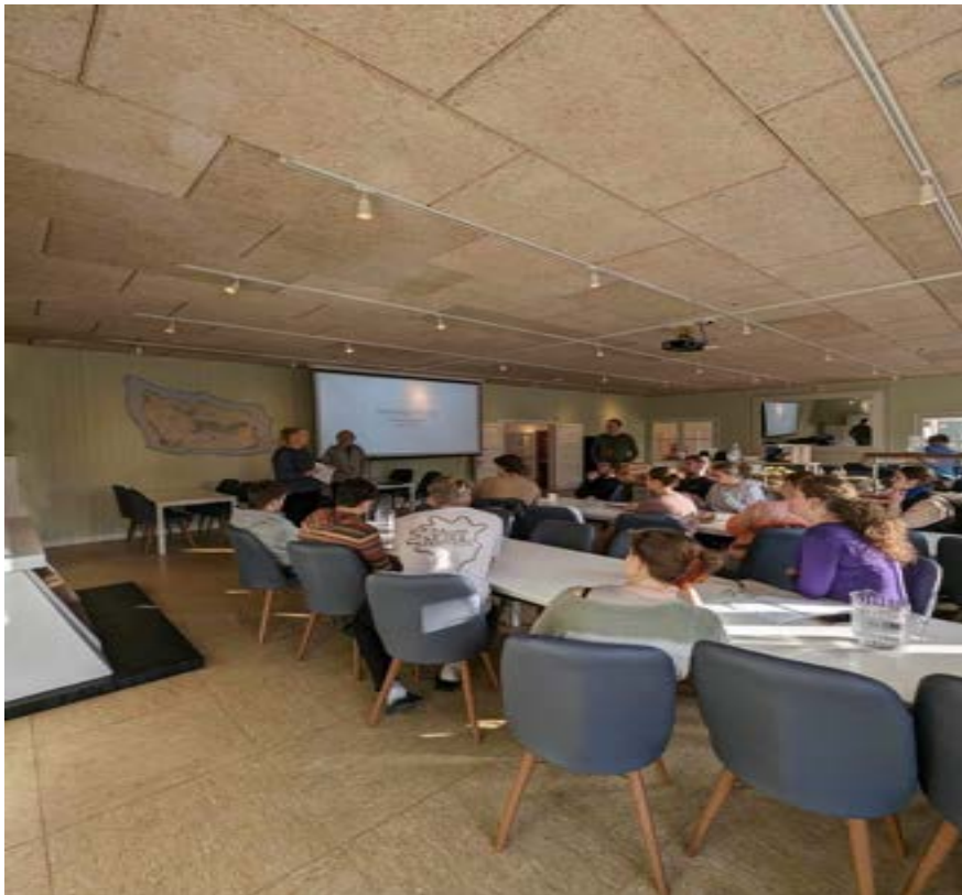
(Danish and Norwegian students at Rønne Vandrerhjem.

Despite thorough preparation and collaboration with BOFA, some cultural and linguistic differences may have led to minor misunderstandings. However, these challenges provided valuable learning opportunities. Direct engagement with key stakeholders, rather than relying on intermediaries, emerged as a crucial factor in improving participation. A more structured onboarding process with clearer communication from BOFA's leadership could have mitigated some of the challenges. Moving forward, these insights will be key in refining the approach to stakeholder engagement in future implementations of the FREIIA project.