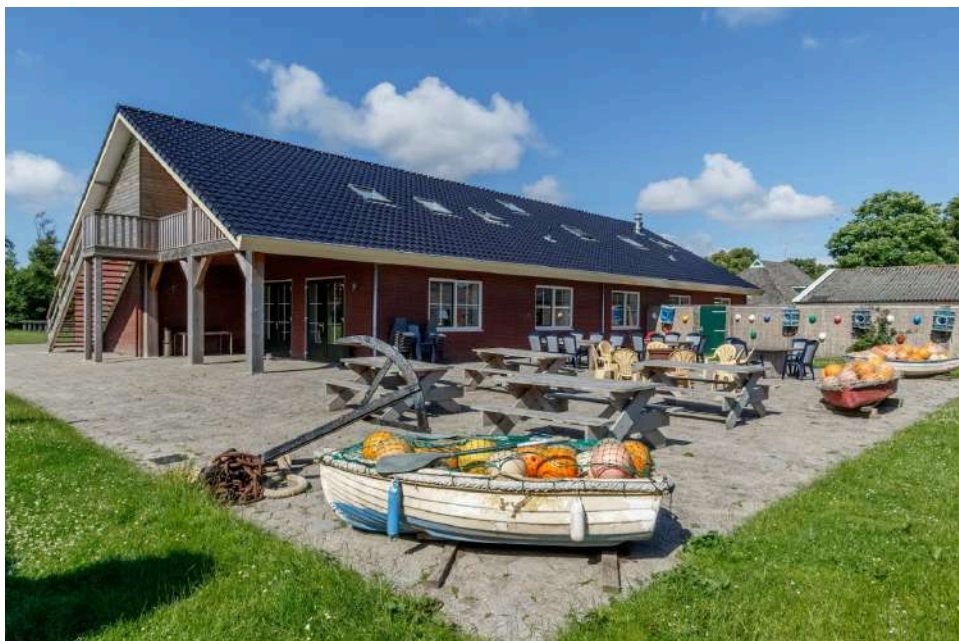
(De Kooiplaats campsite, Schiermonnikoog.)

A key aspect of the project was the involvement of students, whose enthusiasm and creative approaches were crucial to its success. The students stayed at De Kooiplaats on Schiermonnikoog and were organized into international, cross-sector teams of two. These teams explored the island and engaged directly with stakeholders, both from a prearranged list and new contacts they identified during fieldwork. Their ability to adapt and approach individuals with diverse perspectives provided valuable insights and enriched the overall study.