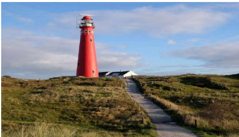
(Noordertoren Lighthouse, Schiermonnikoog.)

The following section focuses on identifying innovation gaps in Schiermonnikoog, Netherlands, using interviews with local stakeholders and students from participating universities. Stakeholders were engaged through targeted outreach via local networks and direct invitations, ensuring diverse input. Students played an active role in conducting semi-structured interviews, gathering insights from community members, businesses, and the municipality. The interviews highlighted key challenges related to sustainable development and cross-sector collaboration, which will inform the next phase of the project, where design thinking methods will be applied to develop solutions.