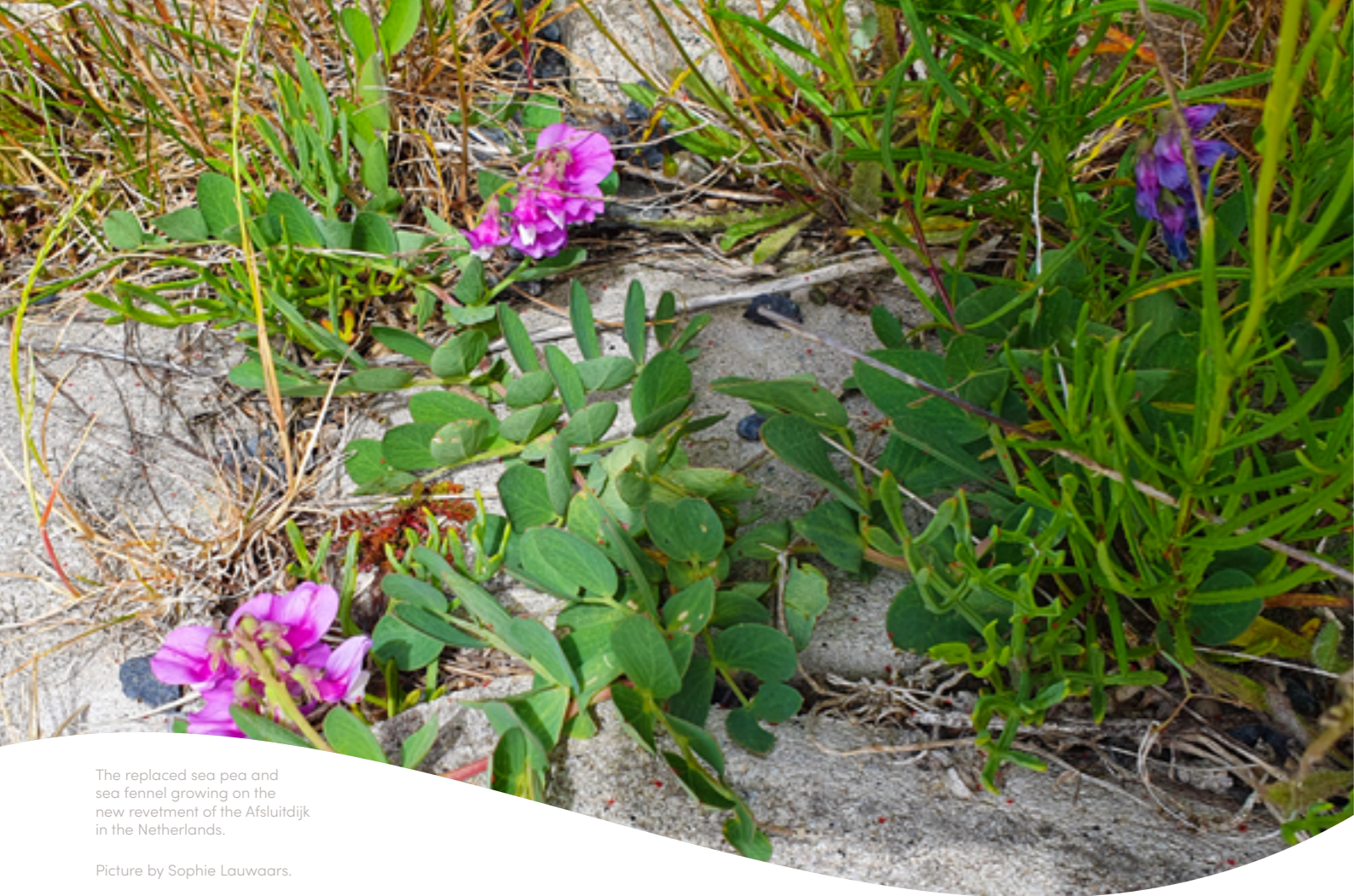
The replaced sea pea and sea fennel growing on the new revetment of the Afsluitdijk in the Netherlands.