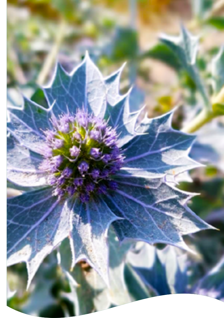
Sea holly in the Living Lab Raversijde pilot in Belgium.