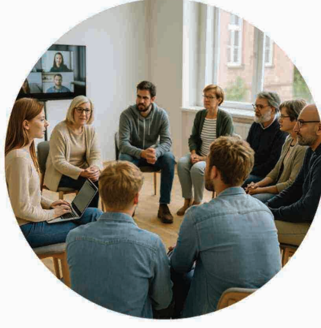
ISLAND COUNCIL Local voices shaping decisions