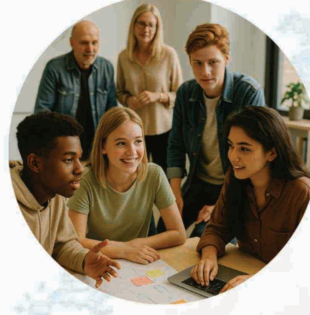
EDUCATION AND YOUTH ENGAGEMENT Youth leading island development