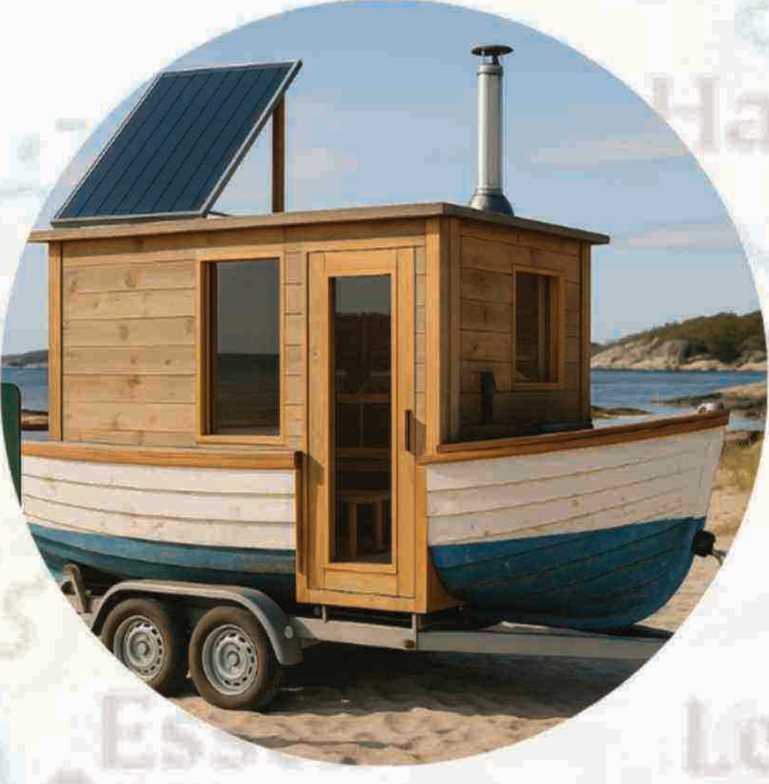
MOBILE SAUNA INITIATIVE Solar-powered sauna on wheels