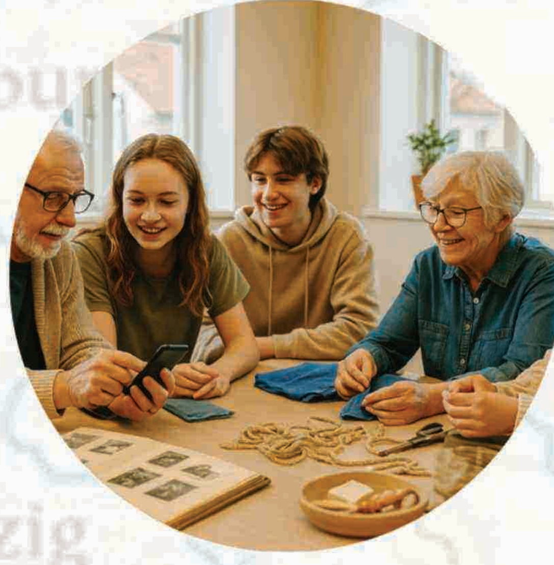
INTERGENERATIONAL EXCHANGE AND EVENTS Youth and elders learning together