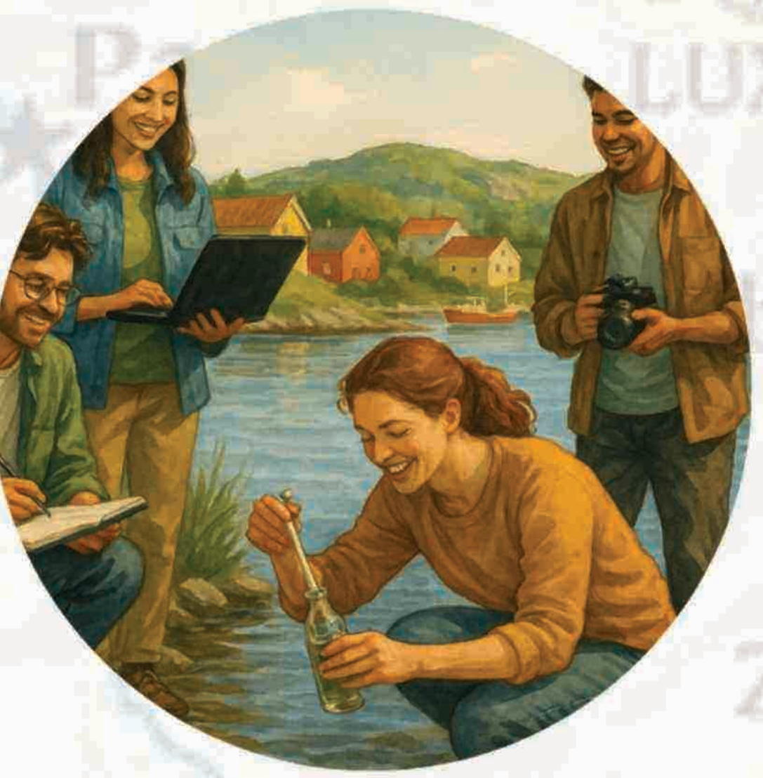
ACADEMIC ISLAND RESIDENCY PROGRAM