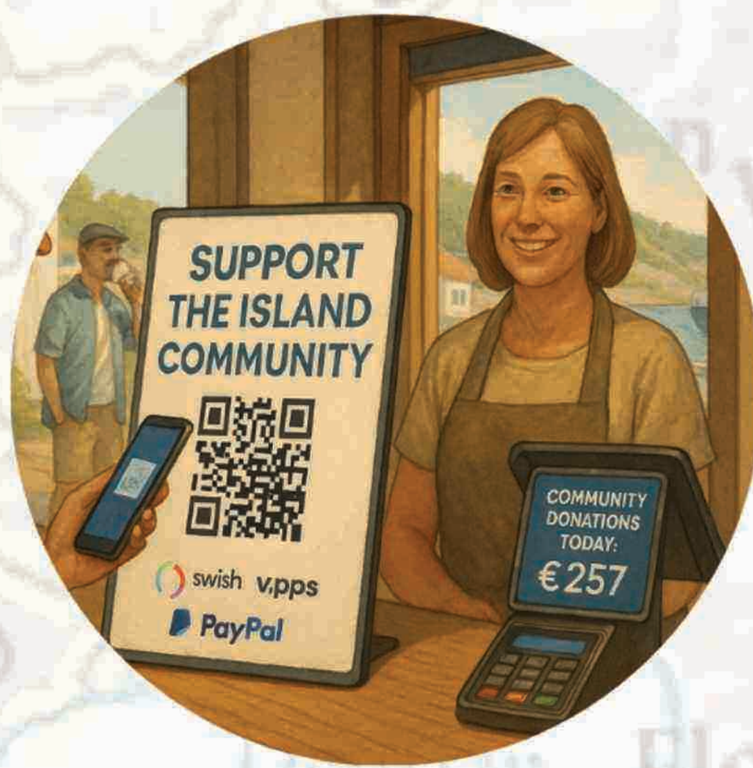
VOLUNTARY TOURIST CONTRIBUTION