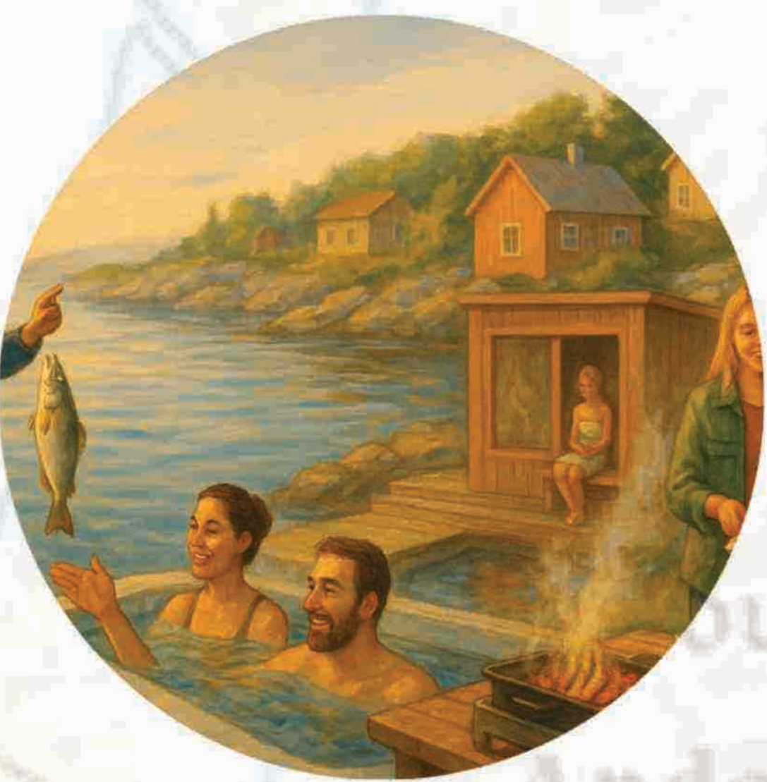
A DAY IN THE ISLAND PARADISE