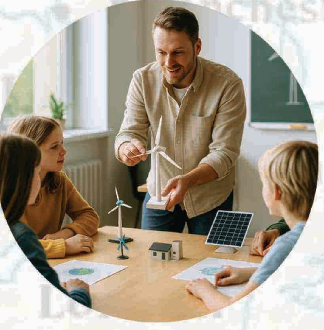
ENERGY CULTURE THROUGH EDUCATION Hands-on learning about energy