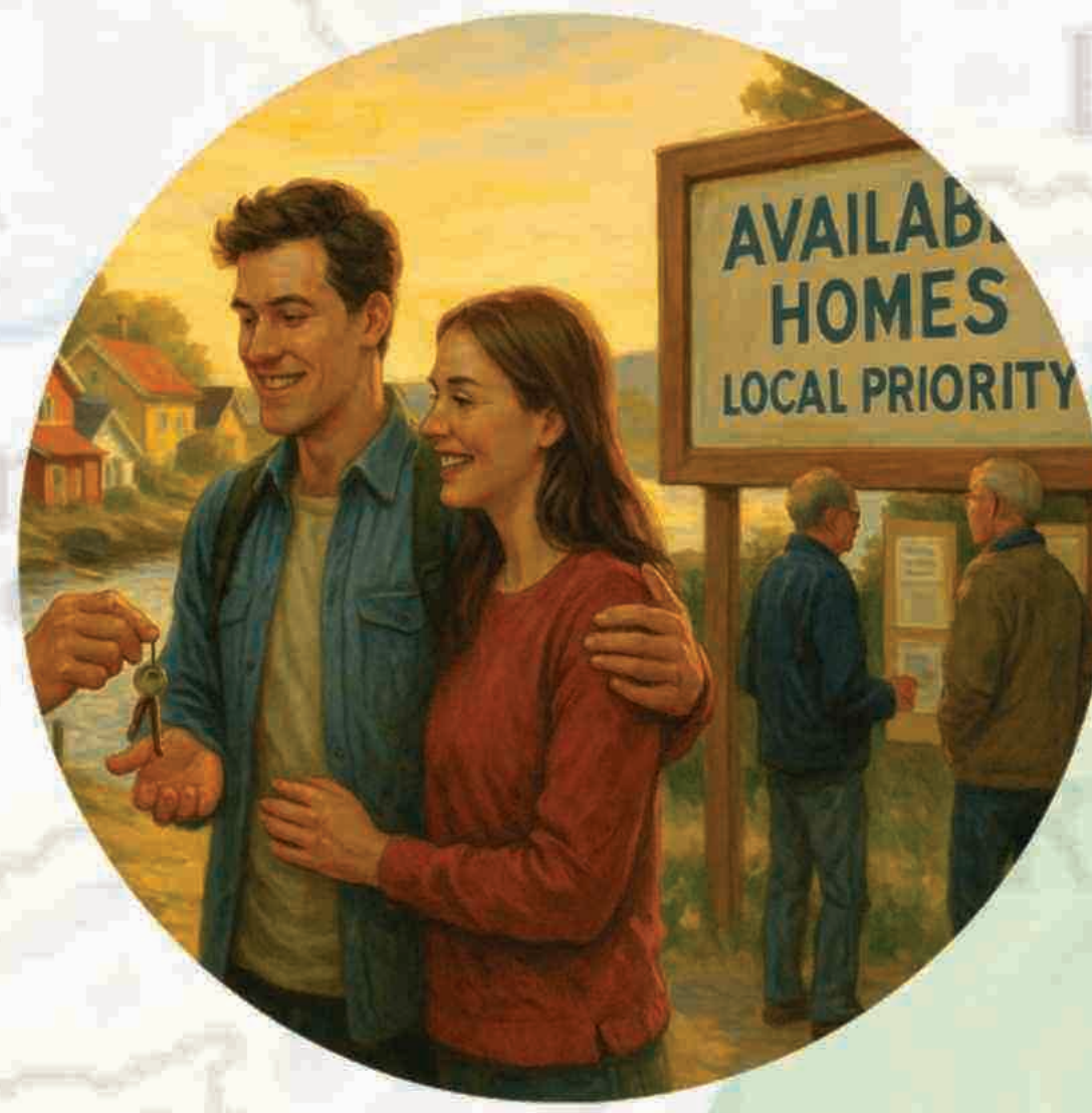
GIVE LOCALS FIRST RIGHT TO BUY OR RENT