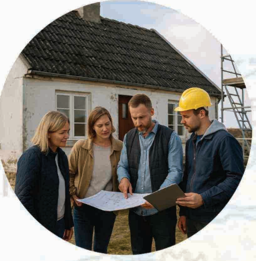
SEASONAL HOUSING Affordable homes for seasonal staff