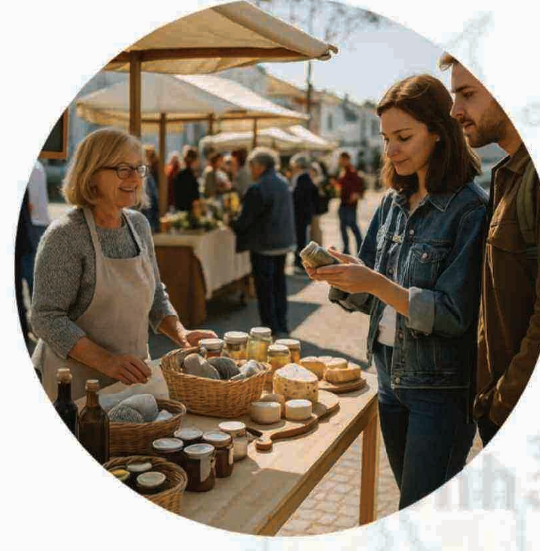
MARKETING LOCAL PRODUCTS & TOURISM Promoting island-made products