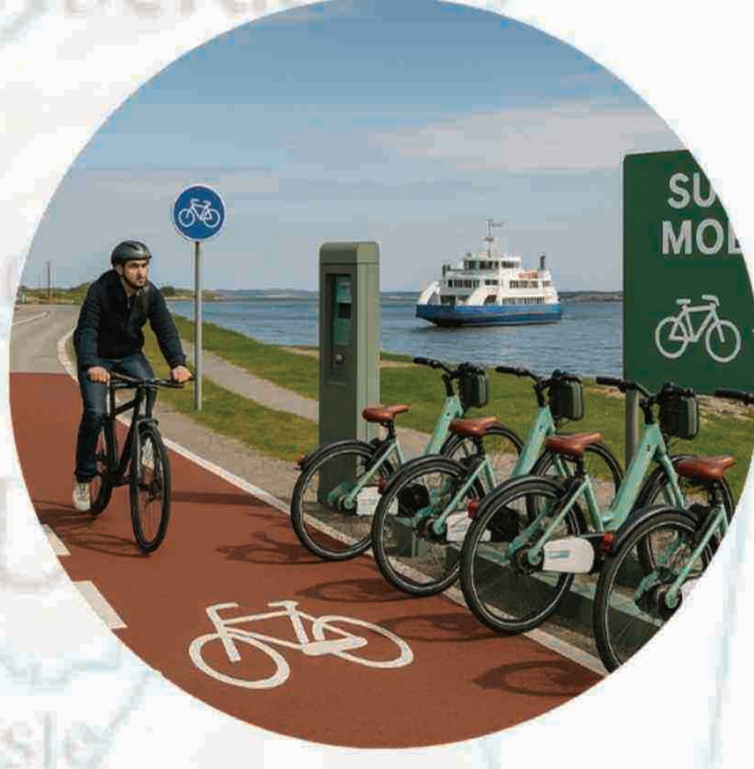
BIKE INFRASTRUCTURE, ECO TRANSPORT, FERRY ACCESS Seamless bike-ferry connections