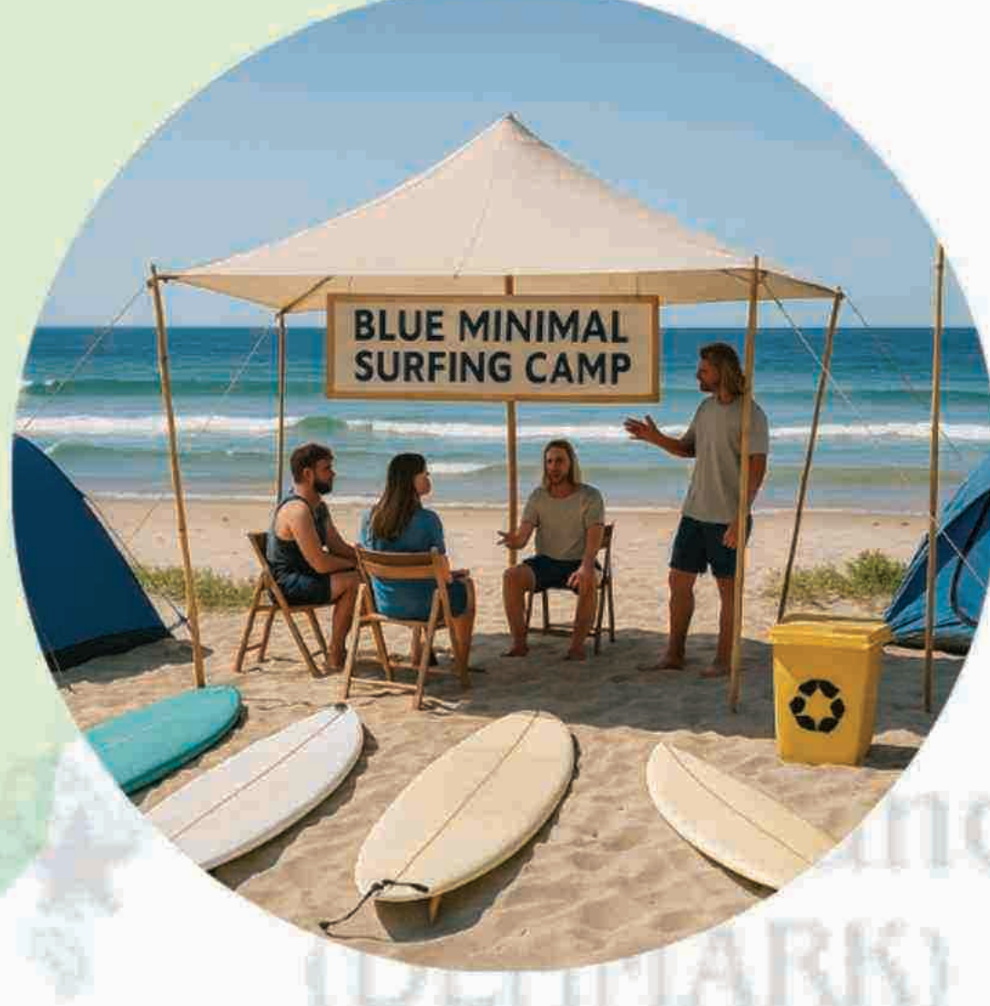
BLUE MINIMAL SURFING CAMP Eco-friendly surf and nature retreat