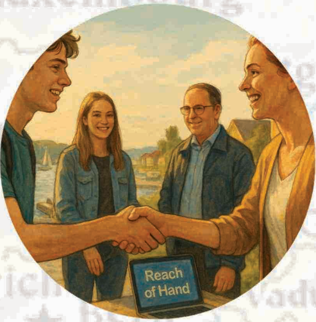
REACH OF HAND