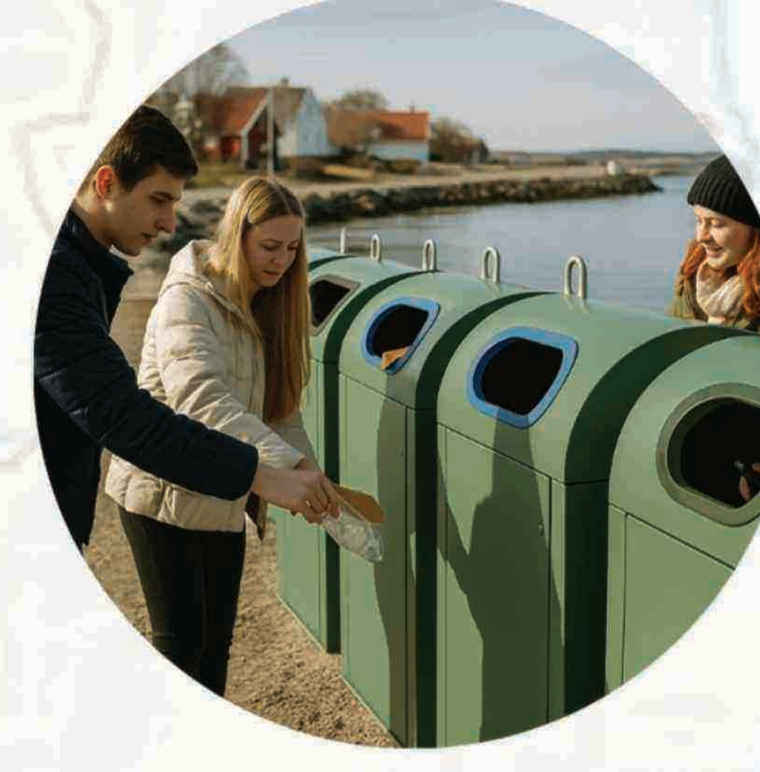
RECYCLING, ENGAGE THE COMMUNITY Community-driven recycling upgrade