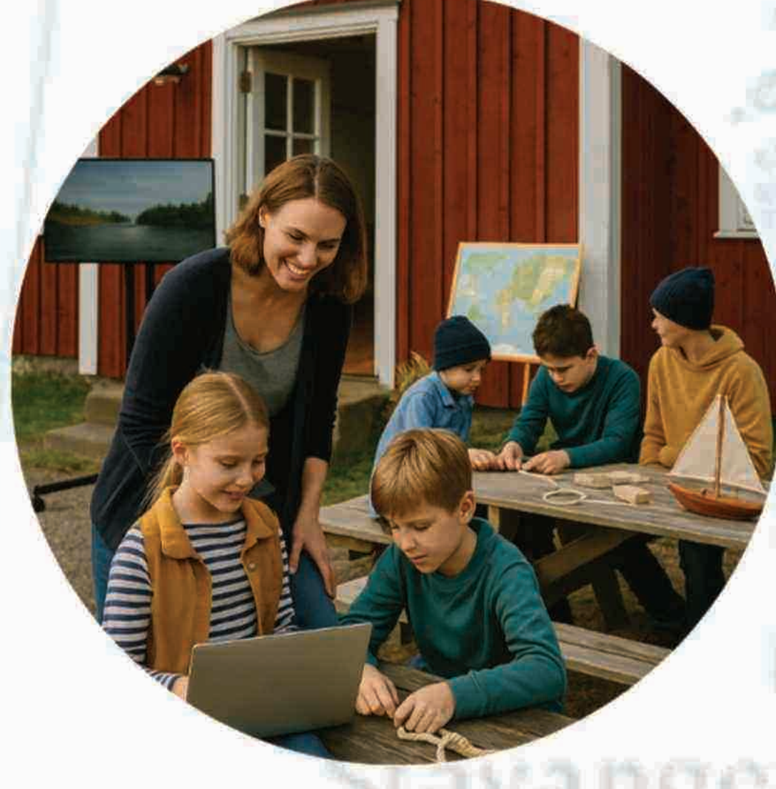
REOPENING THE LOCAL SCHOOL Modern multi-age island school