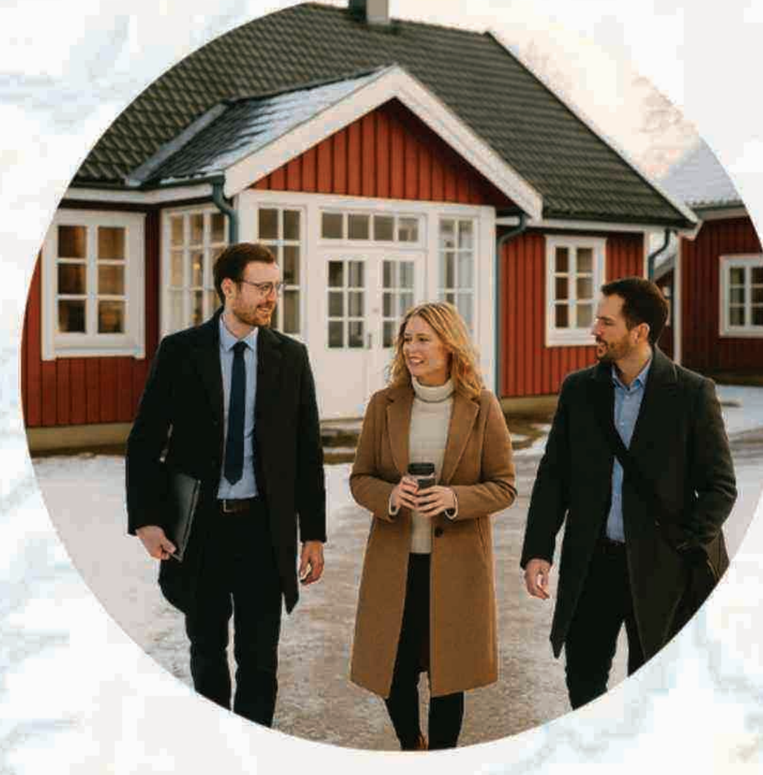
KOSTER - WINTER DESTINATION - BUSINESSES Winter retreats for Nordic teams