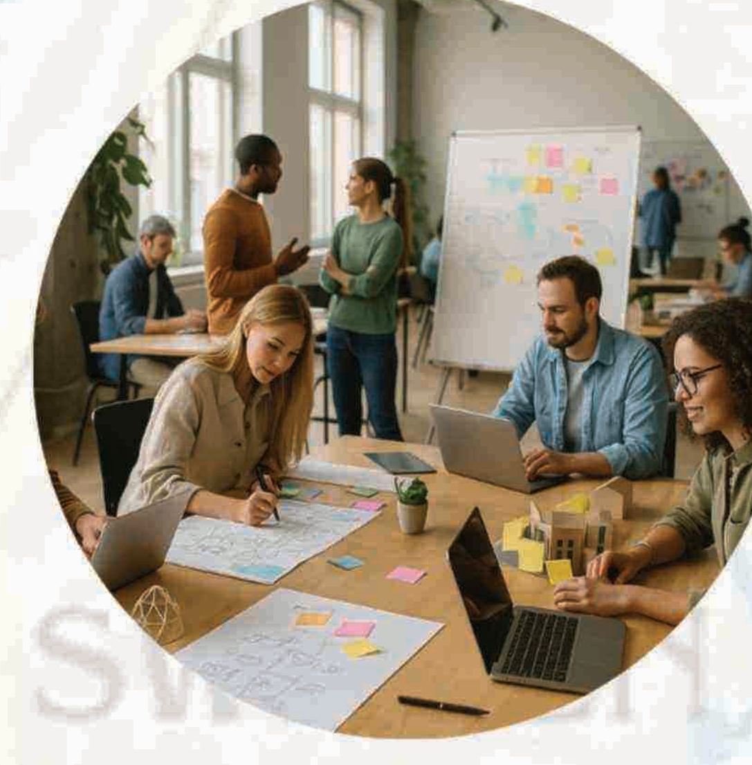
COLLABORATION AND INNOVATION Cross-sector teamwork for solutions