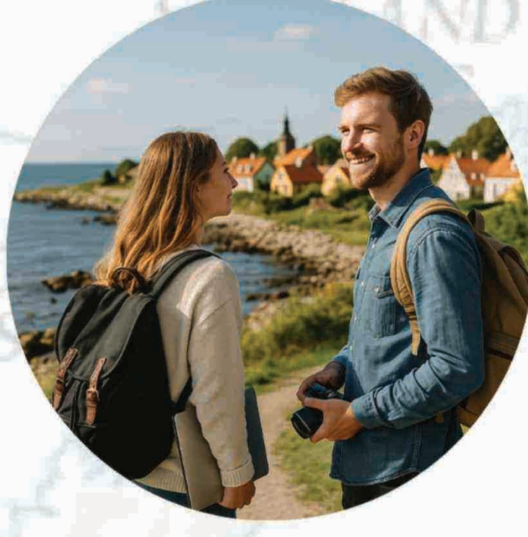
BORNHOLM AS A LIVING DESTINATION Experience island living year-round