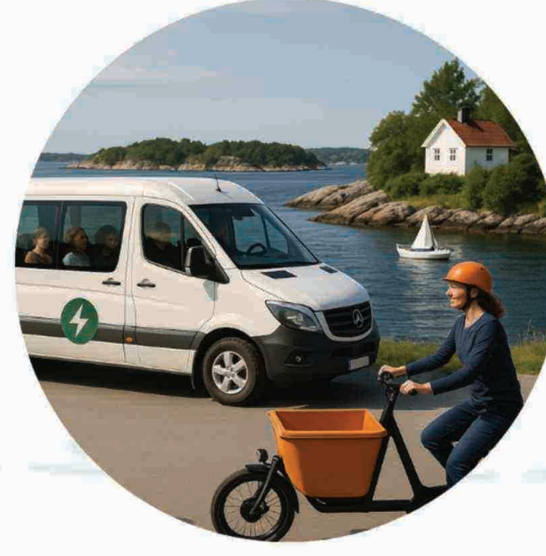
IMPROVED TRANSPORT SOLUTIONS Integrated green mobility for all