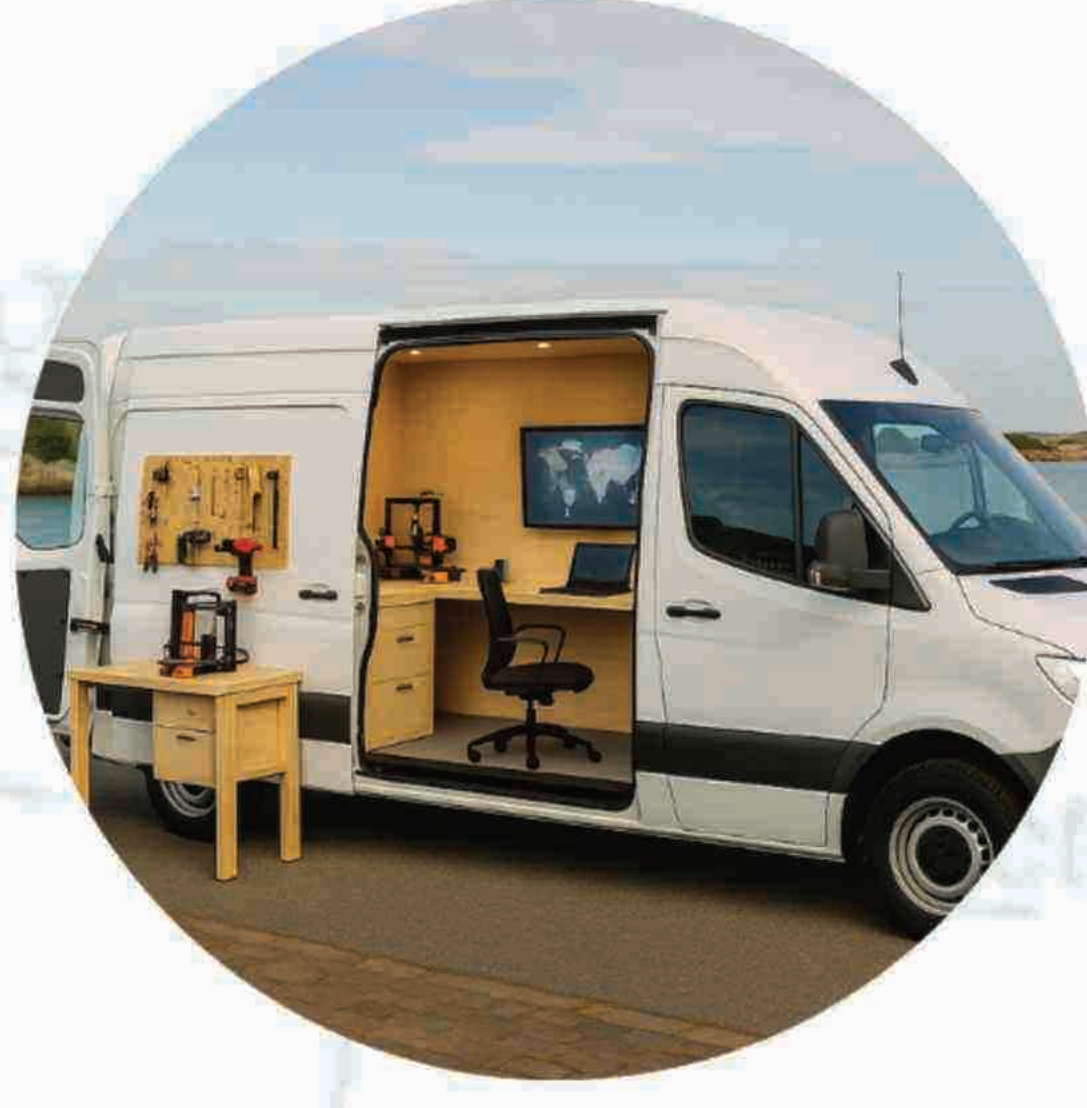
MOBILE INNOVATION HUB Travelling workspace for island innovation