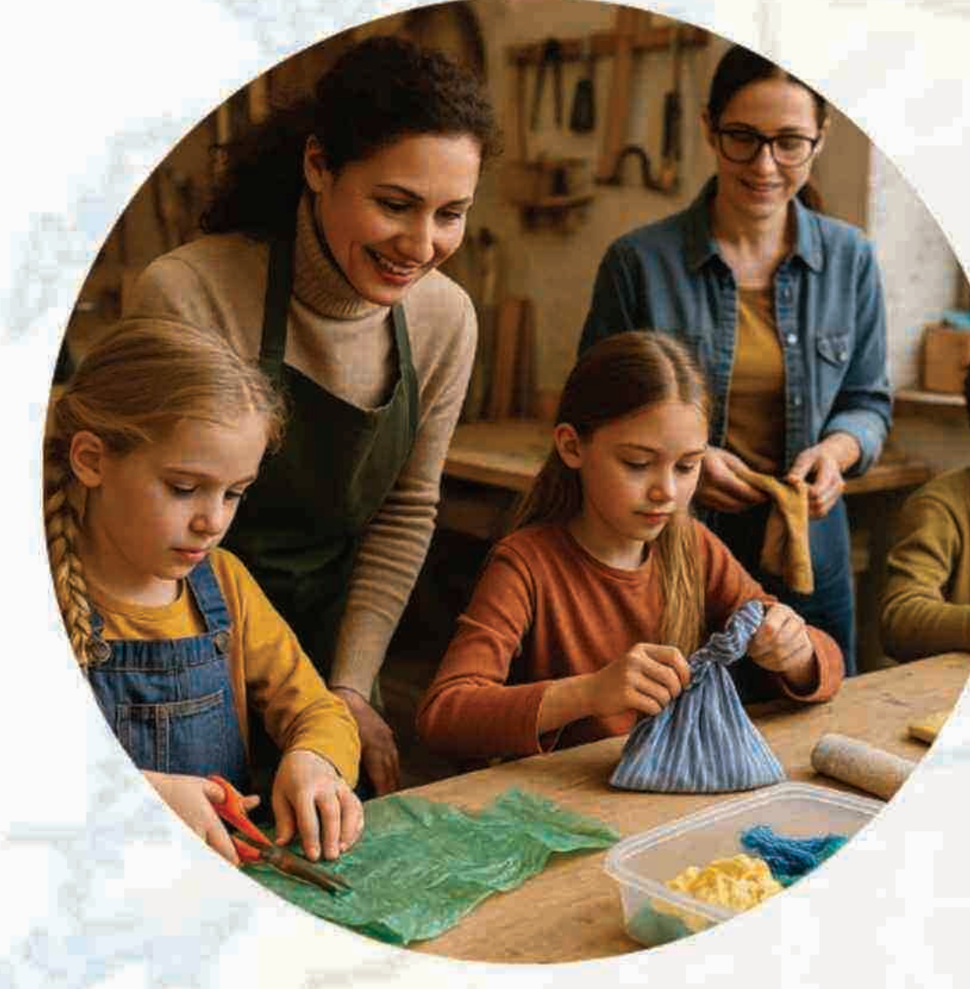
EDUCATING CHILDREN ON WASTE AS A RESOURCE Kids turning waste into value