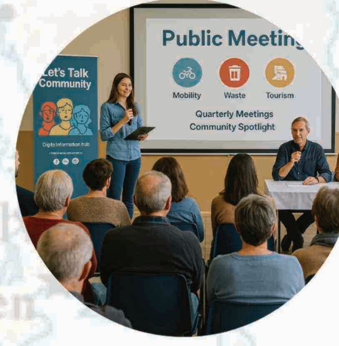
MEETINGS - RESIDENTS AND STAKEHOLDERS Dialogue that strengthens community