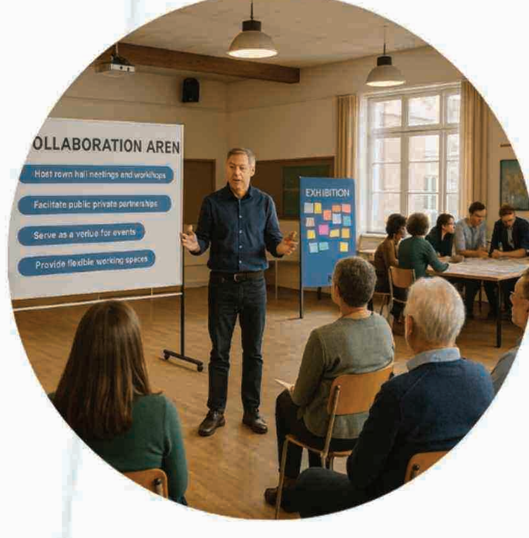
CREATING A COLLABORATION ARENA Shared space for co-creation