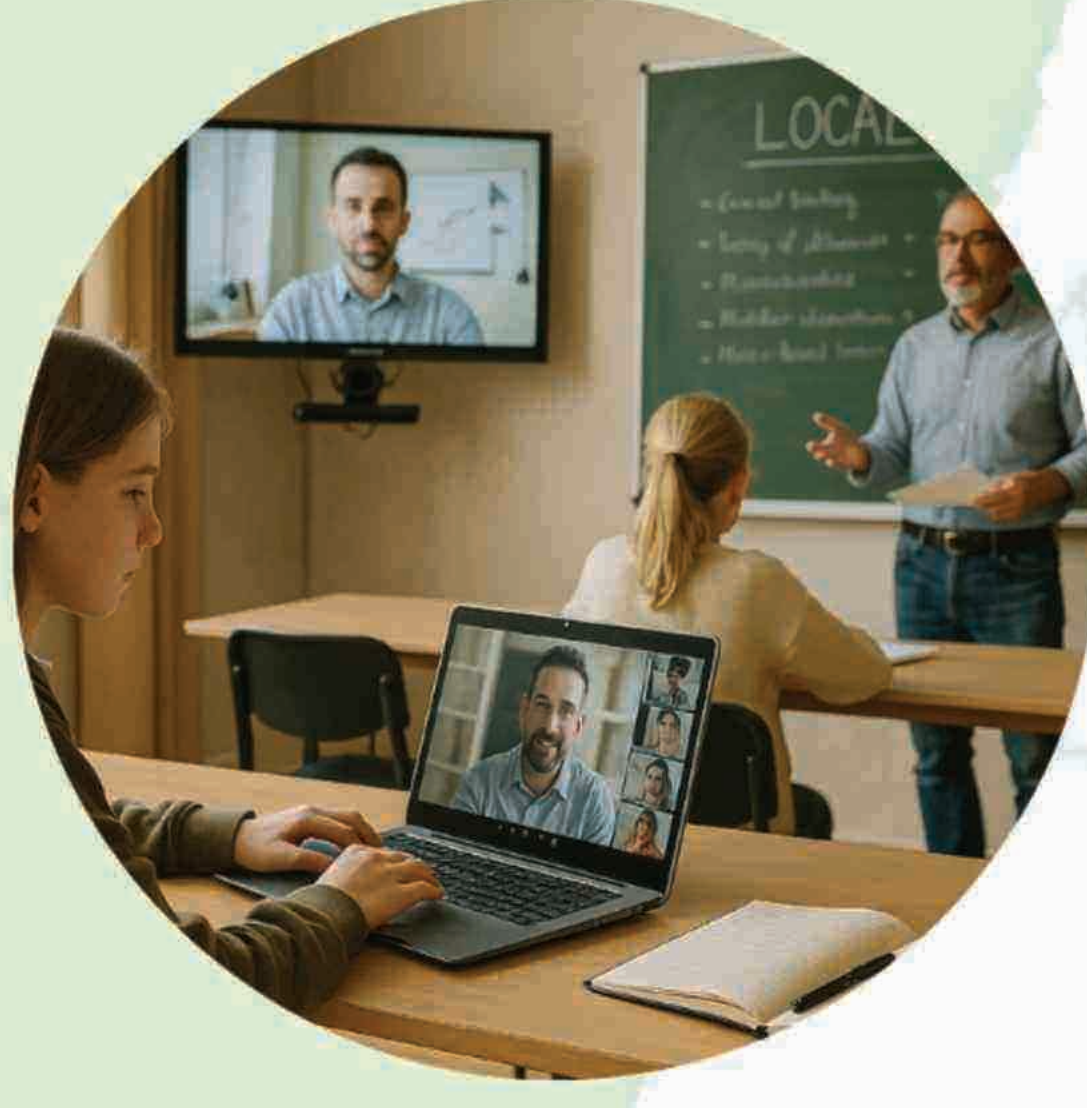
DECENTRALIZED SCHOOL FACILITIES Local learning hubs across islands