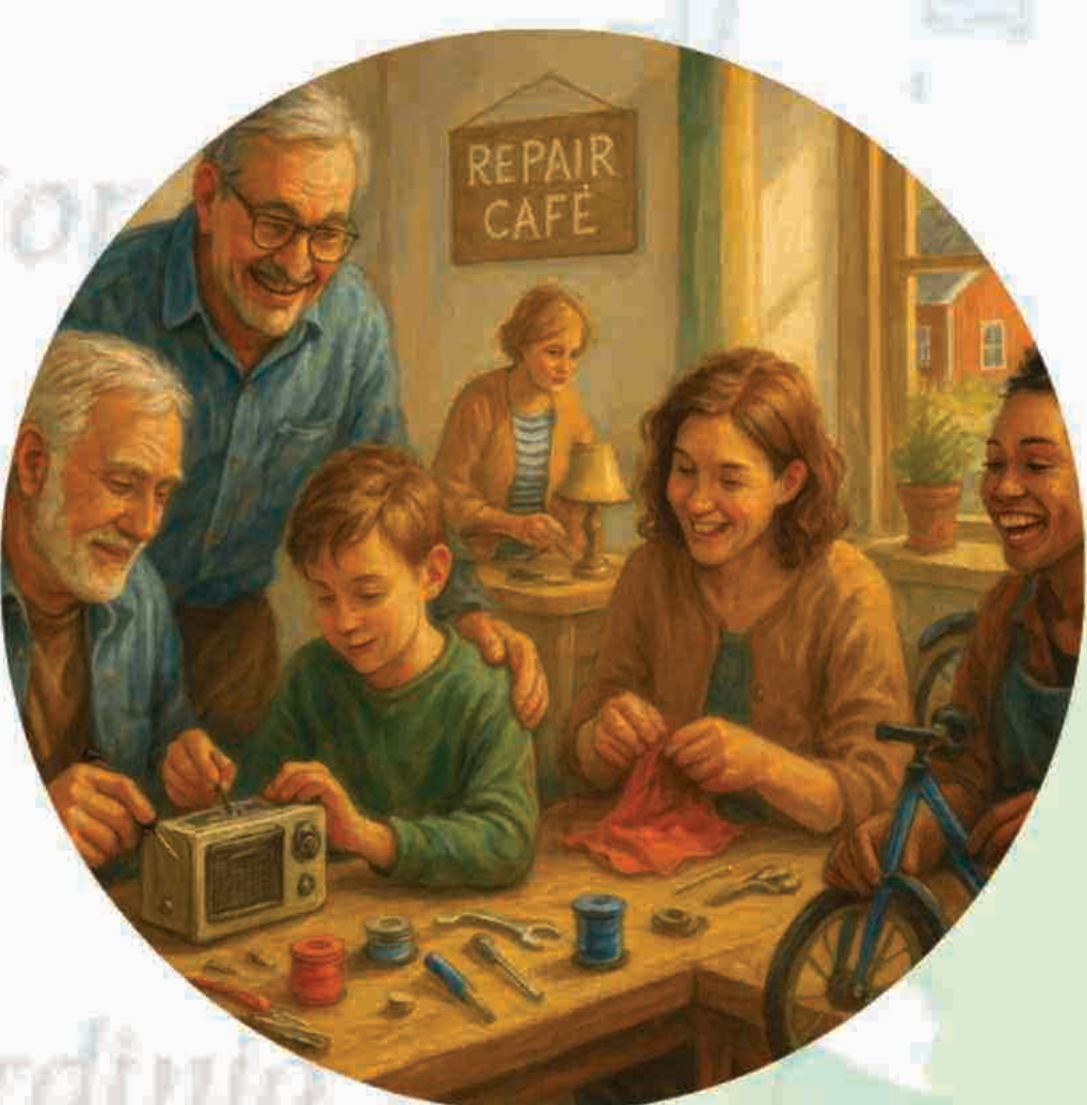
REPAIR CAFE NETWORK