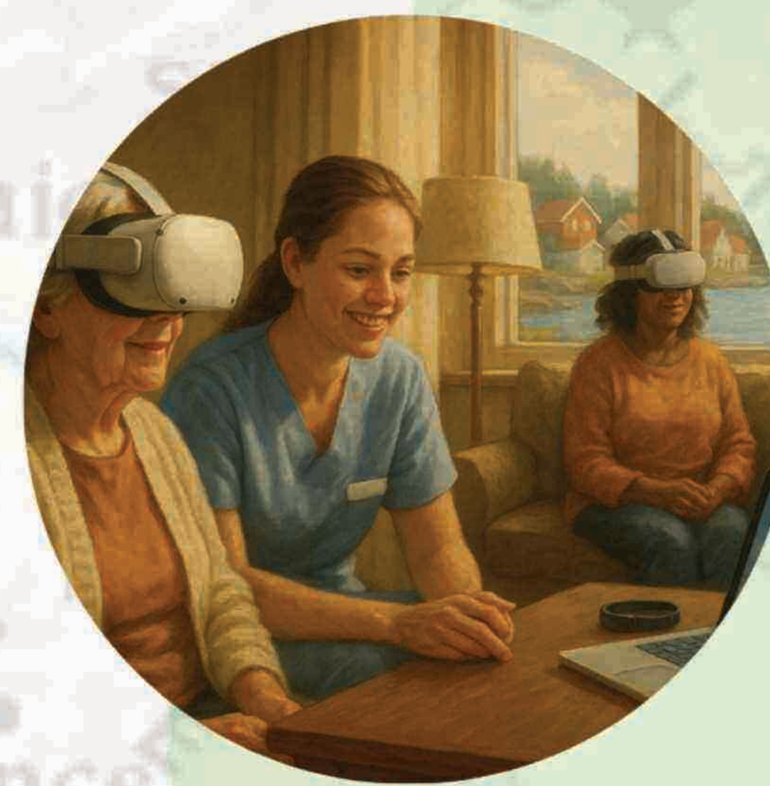
VR - COMMUNITY HEALTH NETWORK