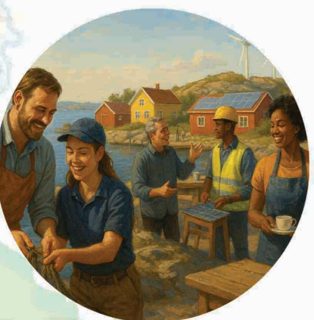
ISLAND WORK EXPERIENCE PROGRAM